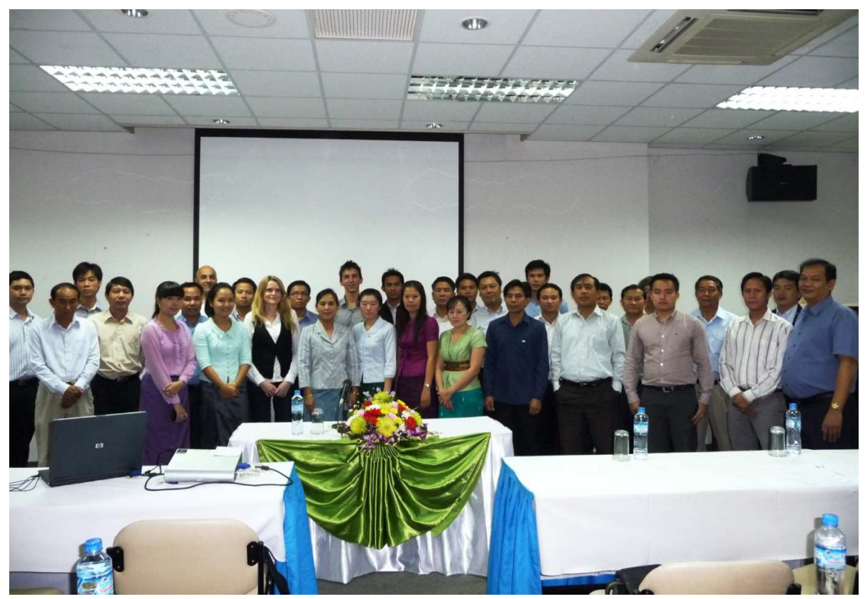
Participants to the seminar on the training for the methodology for the preparation of the program of measures.

• And a last mission that gave the occasion to officially present the final results of the first phase of the project to the Lao partners, and to present the prospects of development for the second phase of the project (2014-2015).