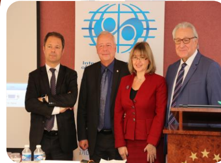
14 th EURO INBO Conference, Lourdes, France – October 2016