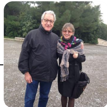
13 th EURO INBO Conference Thessaloniki, Greece – October 2015