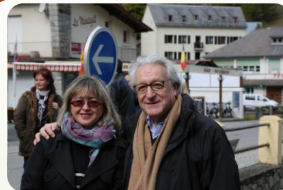
Lourdes, France – October 2016