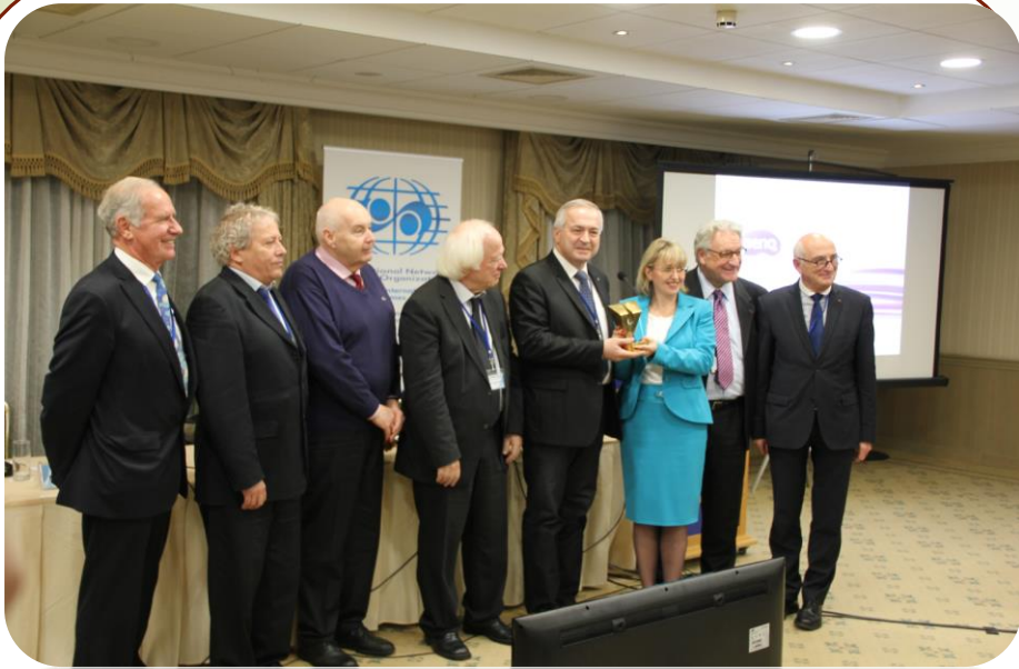
12 th EURO INBO Conference, Bucharest, Romania – November 2014