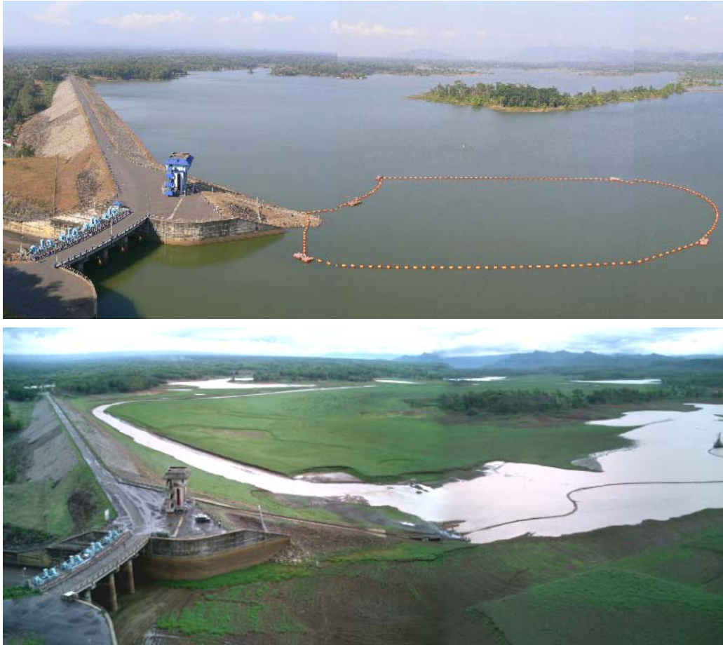
Figure 1 View of the Wonogiri Dam Reservoir during Normal High Water Level – 136 m (above) and Low Water Level - 127 m (below)

An echo sounding survey with global-positioning system (GPS) for the Wonogiri reservoir was conducted over the two periods from October to November 2004 (before entering the wet season) and June to July 2005 (after the wet season) to clarify current status of the sedimentation as well as incremental sediment deposit in the wet season in 2004/2005. From the survey results, the current status of the Wonogiri reservoir is assessed as follows (see Table 2 for details):