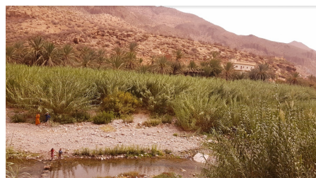
Souss Massa Region