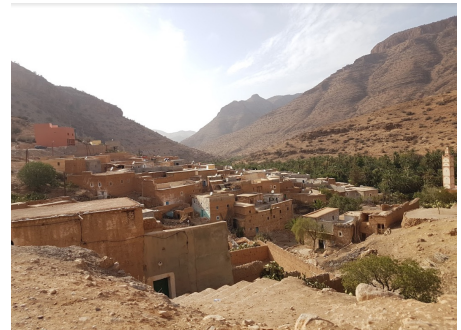
Souss Massa Region