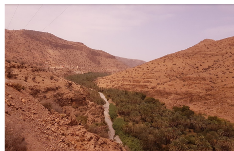
Souss Massa Region