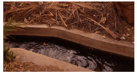
Agricultural parcel, Tiout Oasis