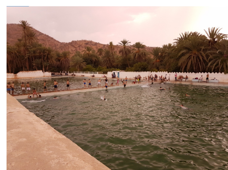
Multi-use reservoir used as storage for irrigation and leisure.