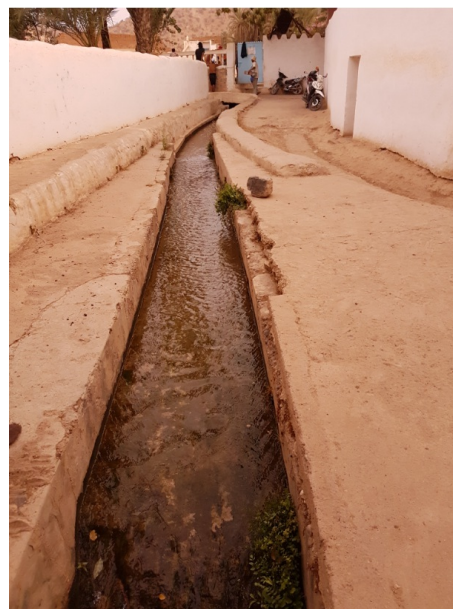
Irrigation channel, Tiout Oasis