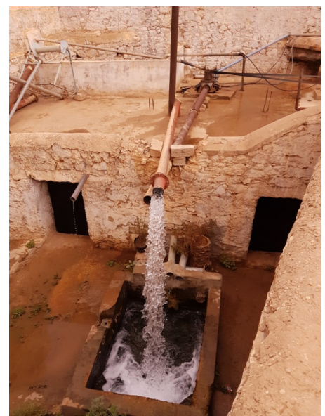
Pumping station, Tiout

Provincial and local development plans identify Tiout as the main town, equipped