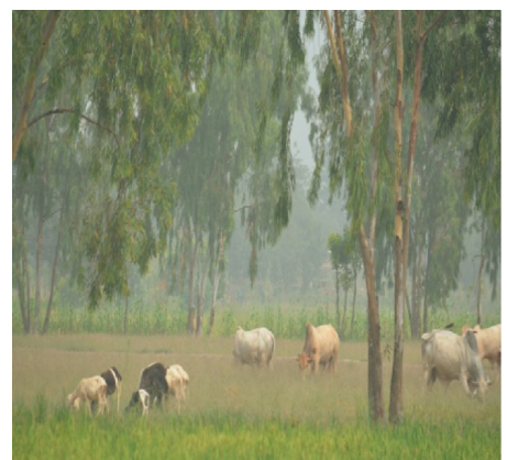
Dallol Maouri ( Mr. Ali Laouel, October 2017)

Significant land use changes have been observed since 1975. Cultivated areas and livestock are increasing to meet growing food needs (the country has one of the highest population growth rates, at around 3.9% (according to the 2012 general population census)). These anthropogenic factors, combined with climatic factors, lead to significant problems of soil degradation (clearing, overgrazing, gullying due to heavy rainfall, reduction in soil fertility, etc). Groundwater resources also