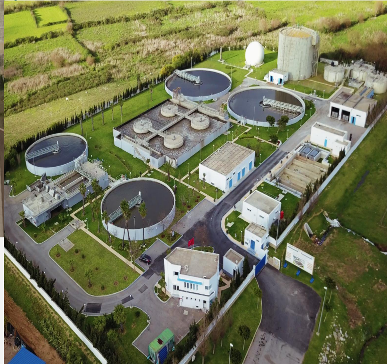
TAMUDA BAY Wastewater treatment plant, Amendis, MOROCCO