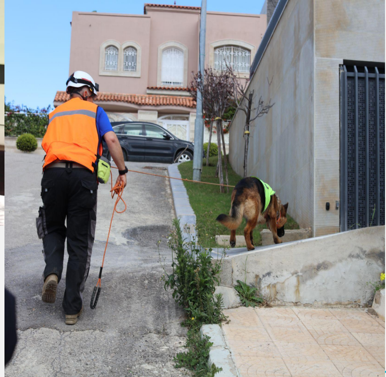
Leak detection - sniffer dogs, Redal, MAROCCO