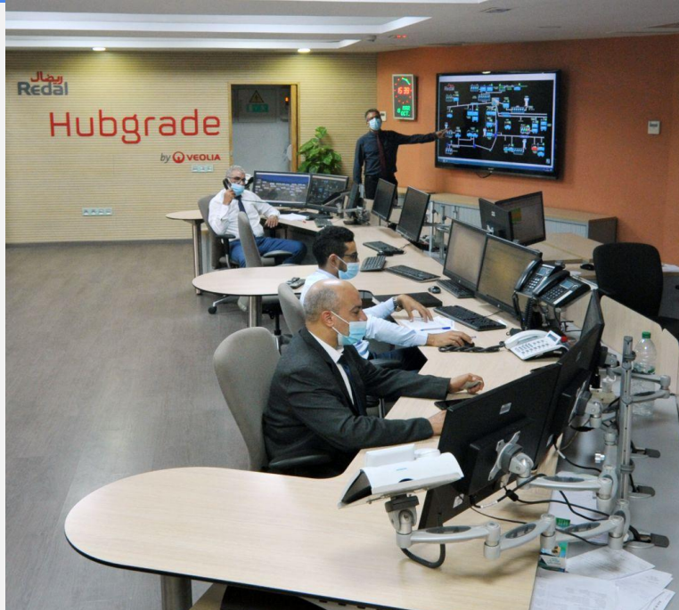
HUBGRADE by Veolia, Redal, MOROCCO