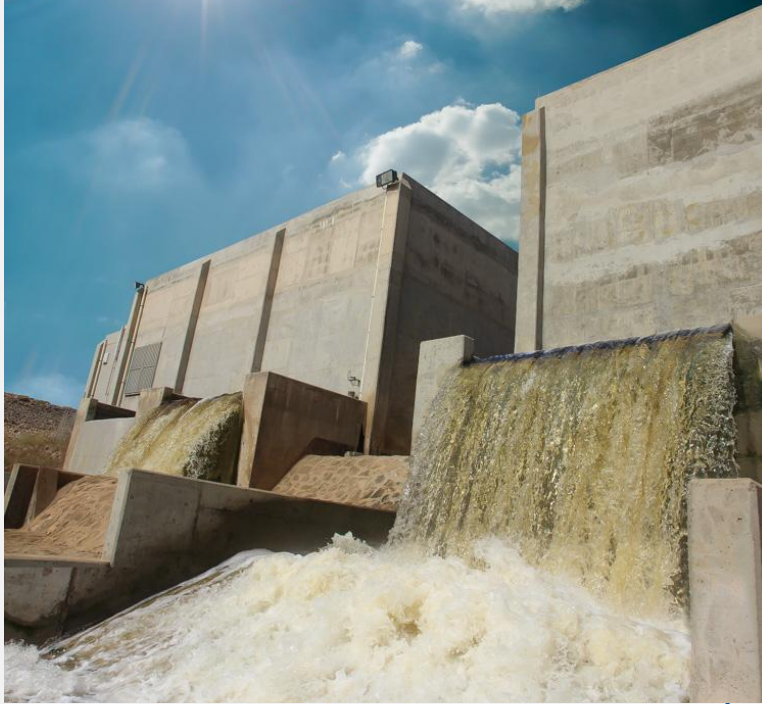
Hydraulic outlet on the SAMRA Wastewater treatment plant, JORDAN