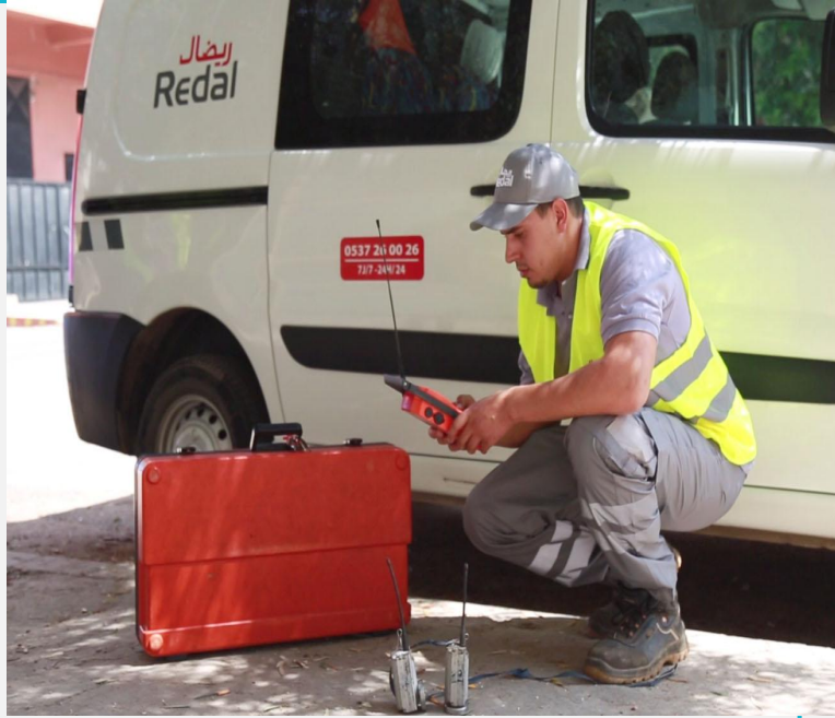
Leak detection - acoustic method, Redal, MAROCCO