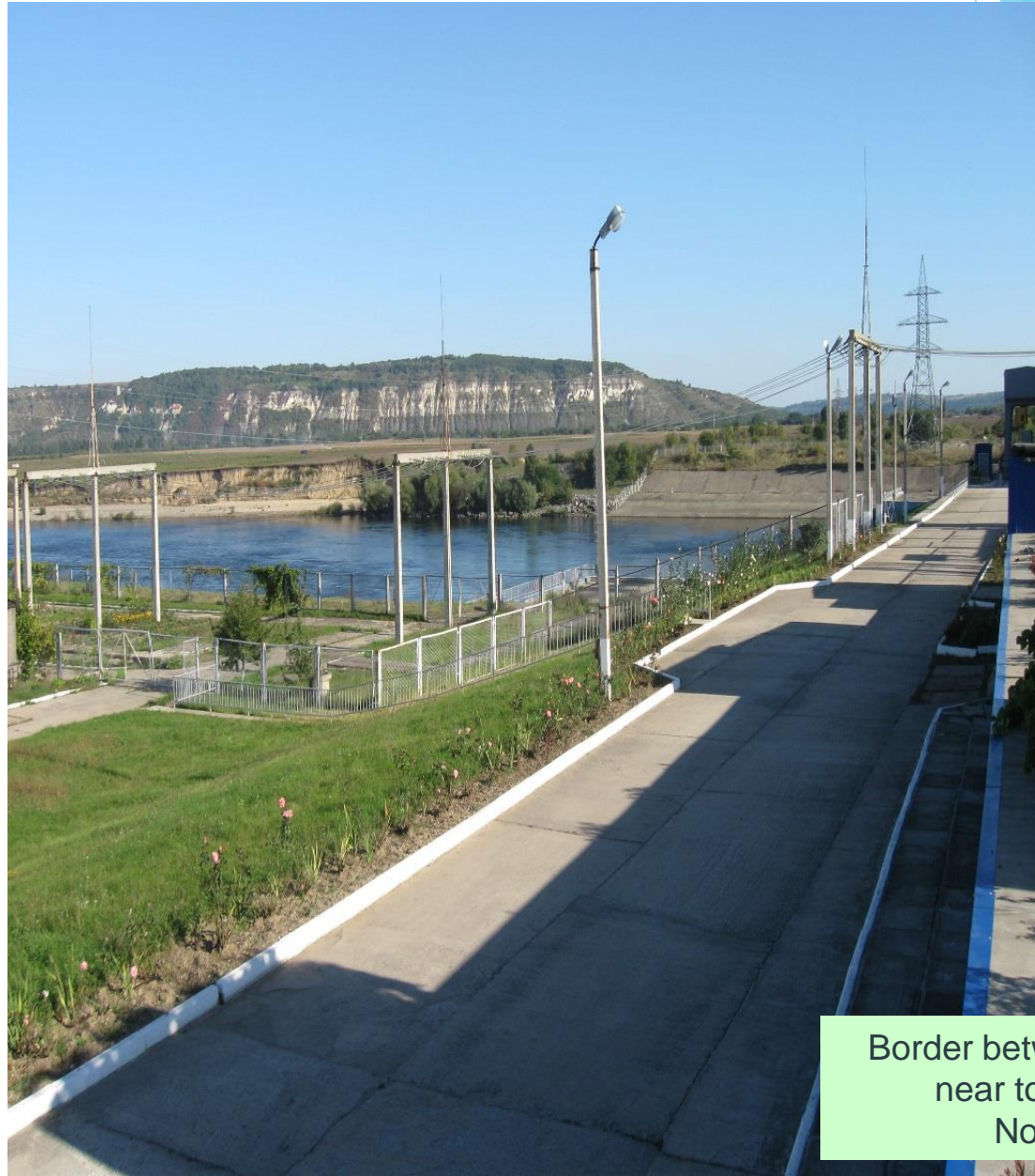
Border between Ukraine and Moldova near to hydropower station at Novodnestrovsc town

The Agreement from 1994 and its institutional mechanism is in need of revision and modernization, especially taking into account modern principles of Integrated Water Resource Management and the need to develop public participation in decision making.