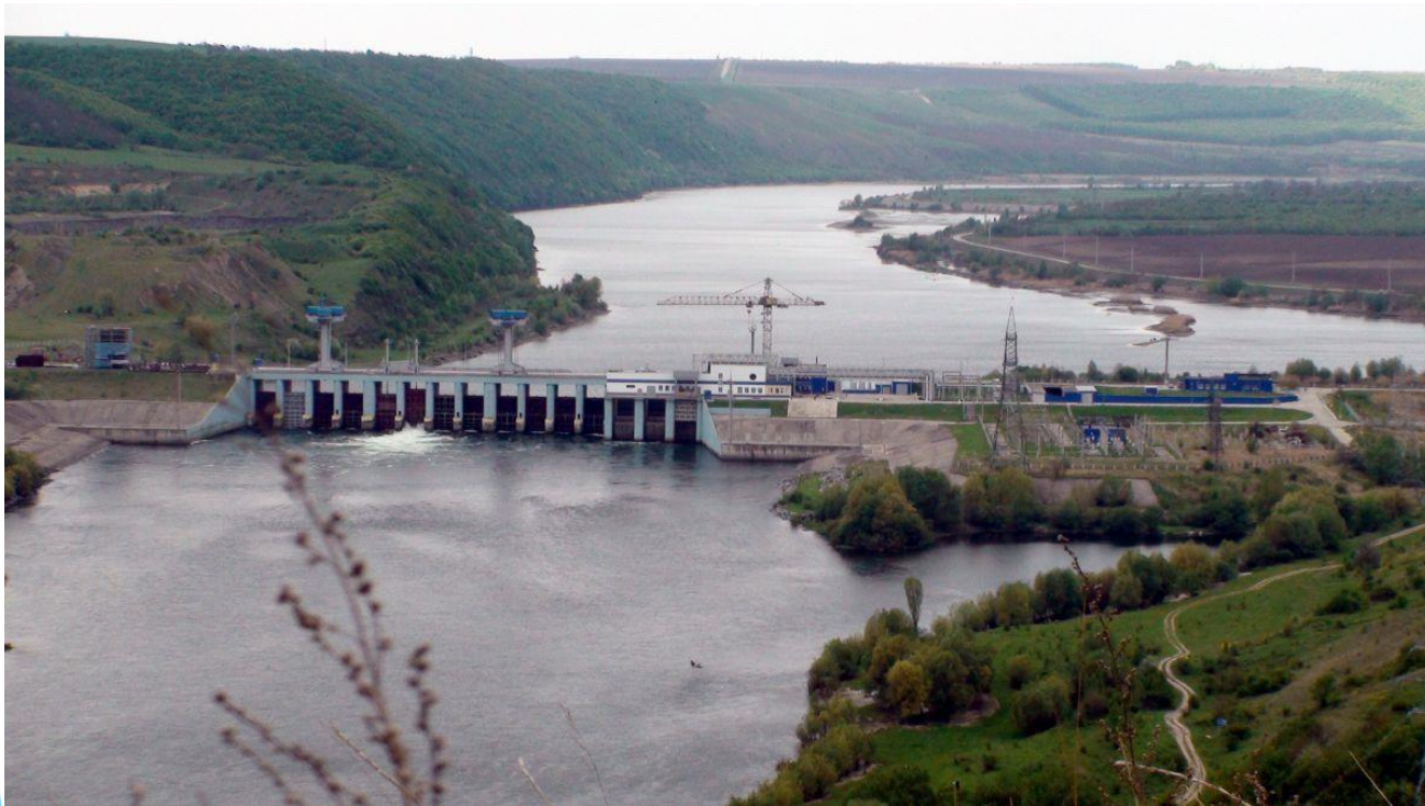
Barrage of the water reservoir Dnestrovsc, Ukraine (HPS-2)