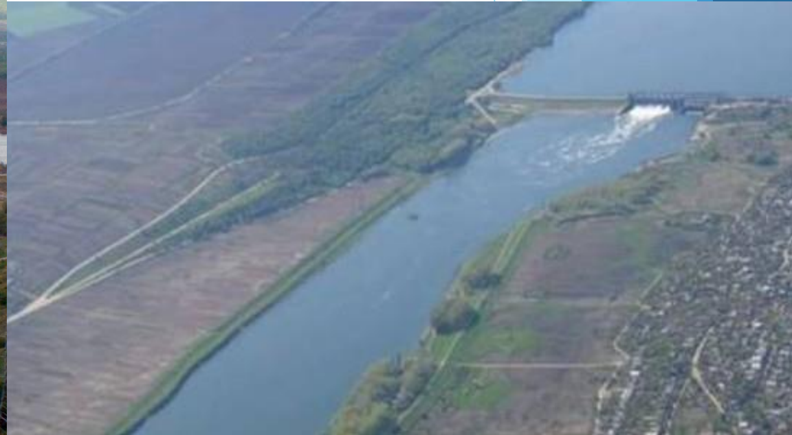
Barrage of the water reservoir DUBASARI, Moldova