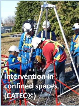
Intervention in confined spaces (CATEC®)