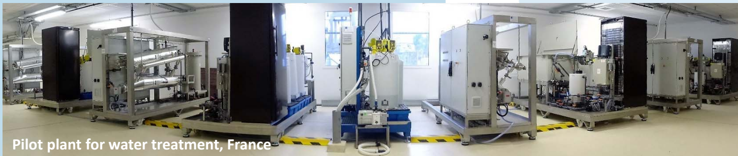
Pilot plant for water treatment, France