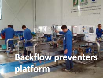
Backflow preventers platform