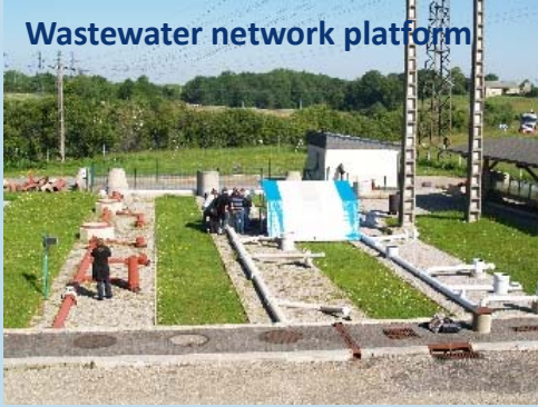
Wastewater network platform